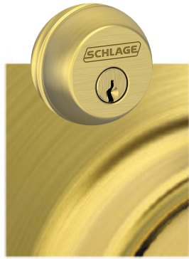
606: Satin Brass US4