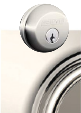
618: Polished Nickel US14