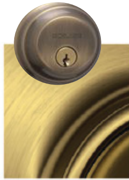
609: Antique Brass US5