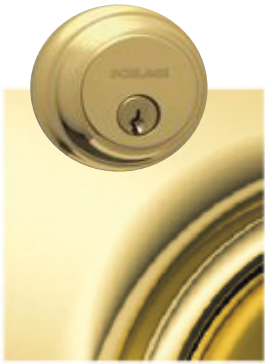
505/605: Bright Brass US3