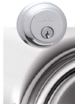
625: Bright Chrome US26