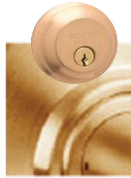
612: Satin/LT Bronze US10