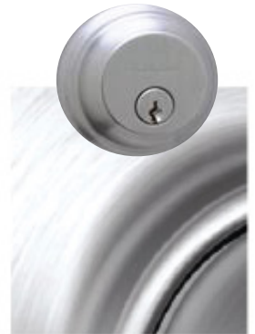
626: Satin Chrome US26D