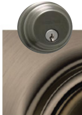
620: Antique Pewter US15A