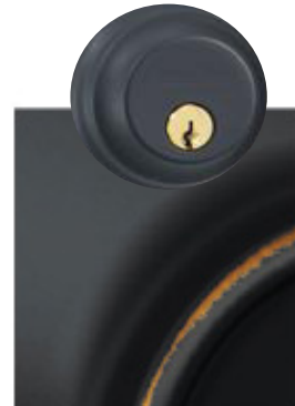
716: Aged Bronze