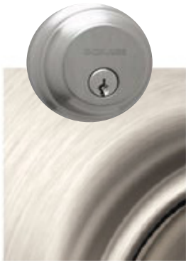
619: Satin Nickel US15