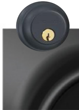
622: Matte Black US19