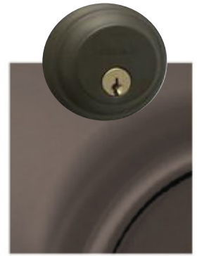
613: Oil Rubbed Bronze US10B