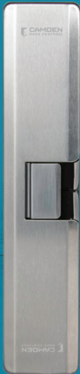
Part#: CAMCX-EPD1289L Hot#: 182393